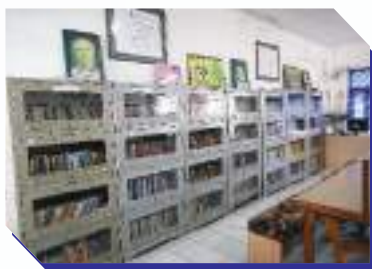
Library: Well-stocked with books, journals, and digital resources.