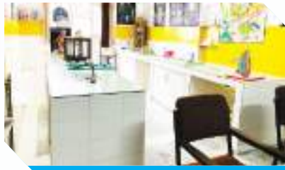
Science Labs : Dedicated Physics, Chemistry, Biology and Composite Junior Science Lab.