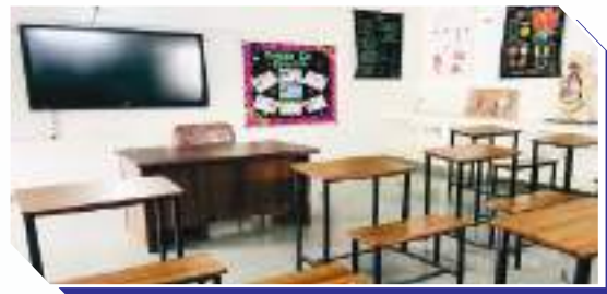
Psychology lab : Used for teaching Psychology and to have student support program - SSP