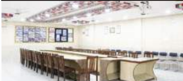
Conference Hall - The School has two big halls for intra and interschool competitions.