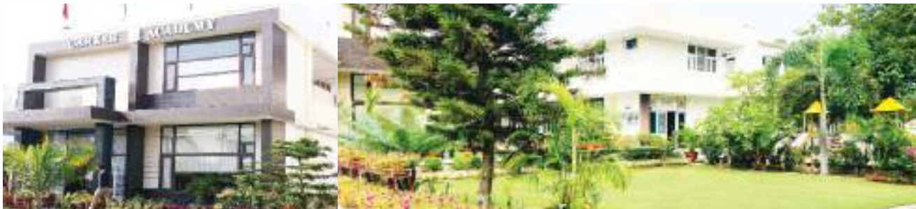
Campus: Lush, green environment conducive to learning and growth.