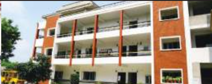
States-of-the-art classrooms with smart panels by Promark.