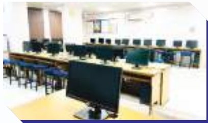
Computer Labs: Junior and Senior labs for digitally integrated learning