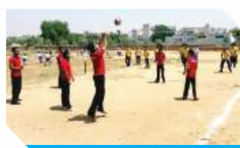
Sports Facilities: Basketball courts, football fields, and indoor sports.